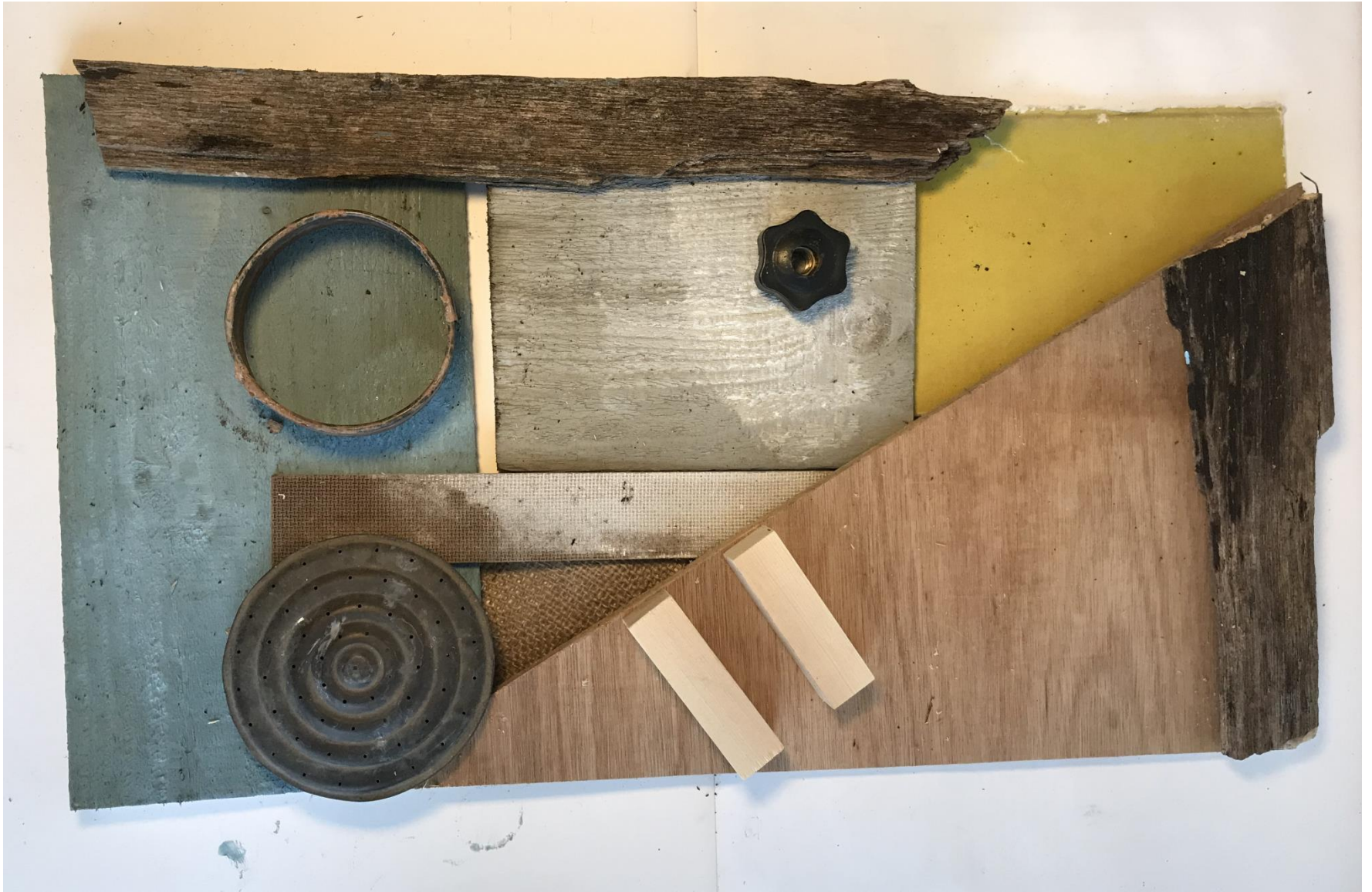
Example of an assemblage created in the style of Margaret Mellis at Rowena Tarplee Art Workshop