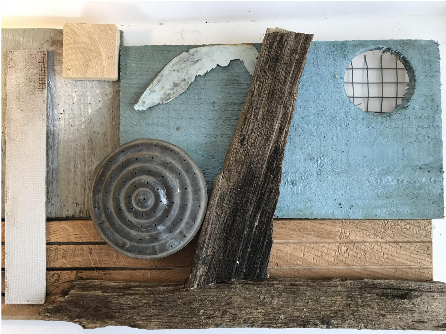
Example of an assemblage created in the style of Margaret Mellis, Rowena Tarplee Workshop