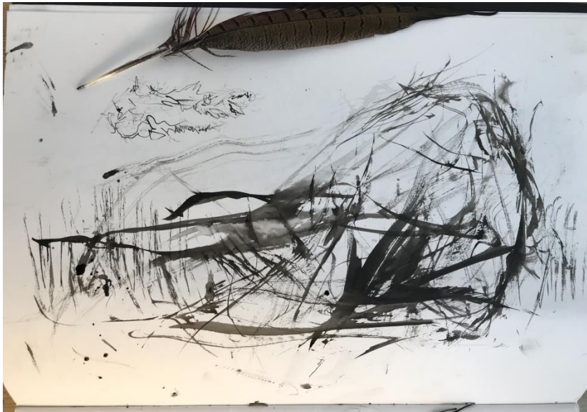
Rowena Tarplee Art Workshops