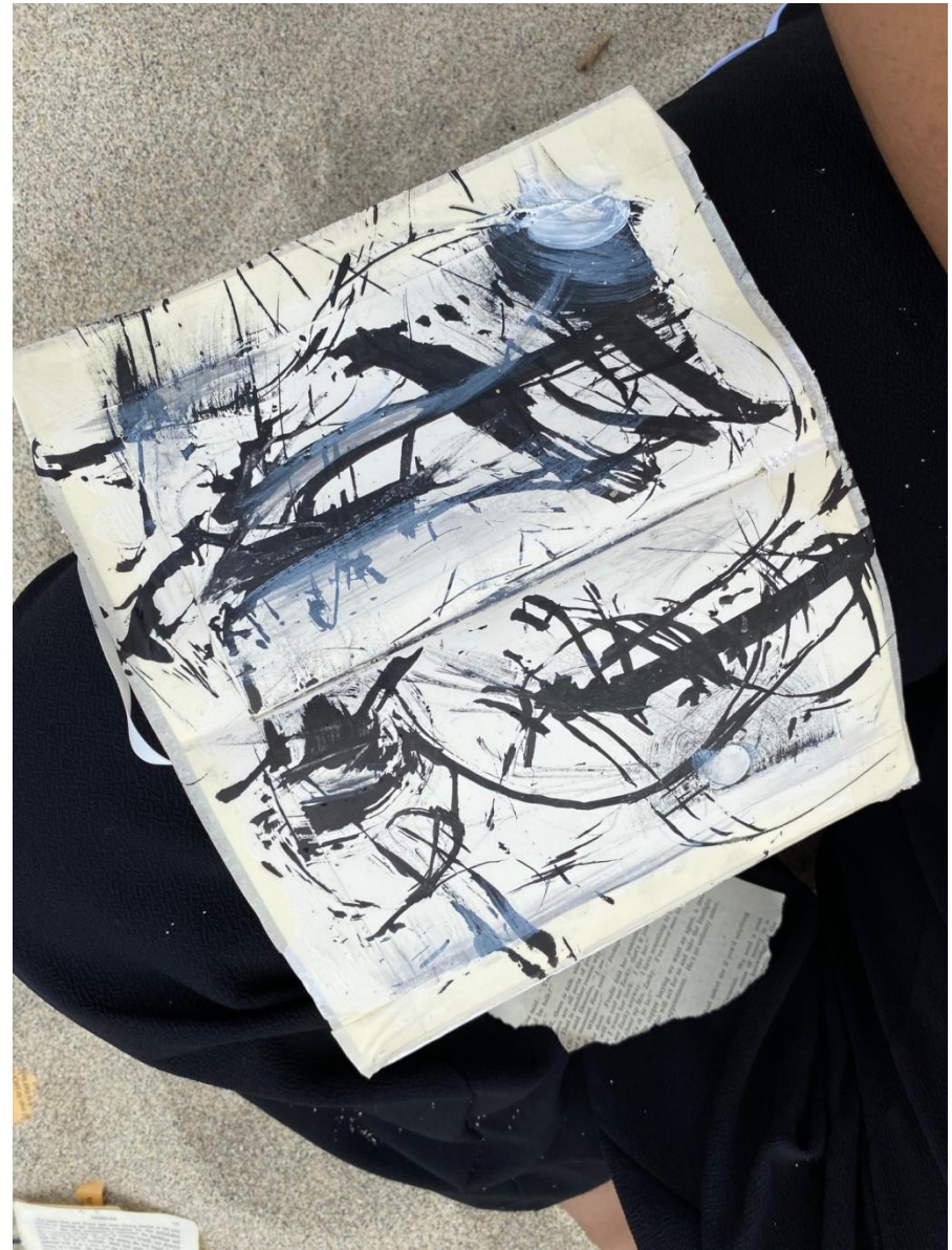
Rowena Tarplee Art Workshops