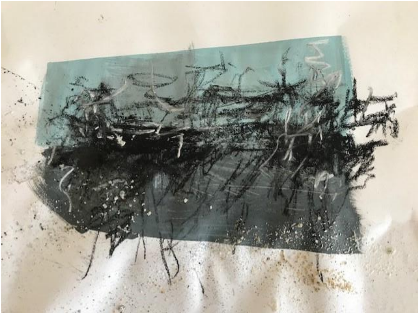
Expressive Mark-Making on Porthmeor Beach