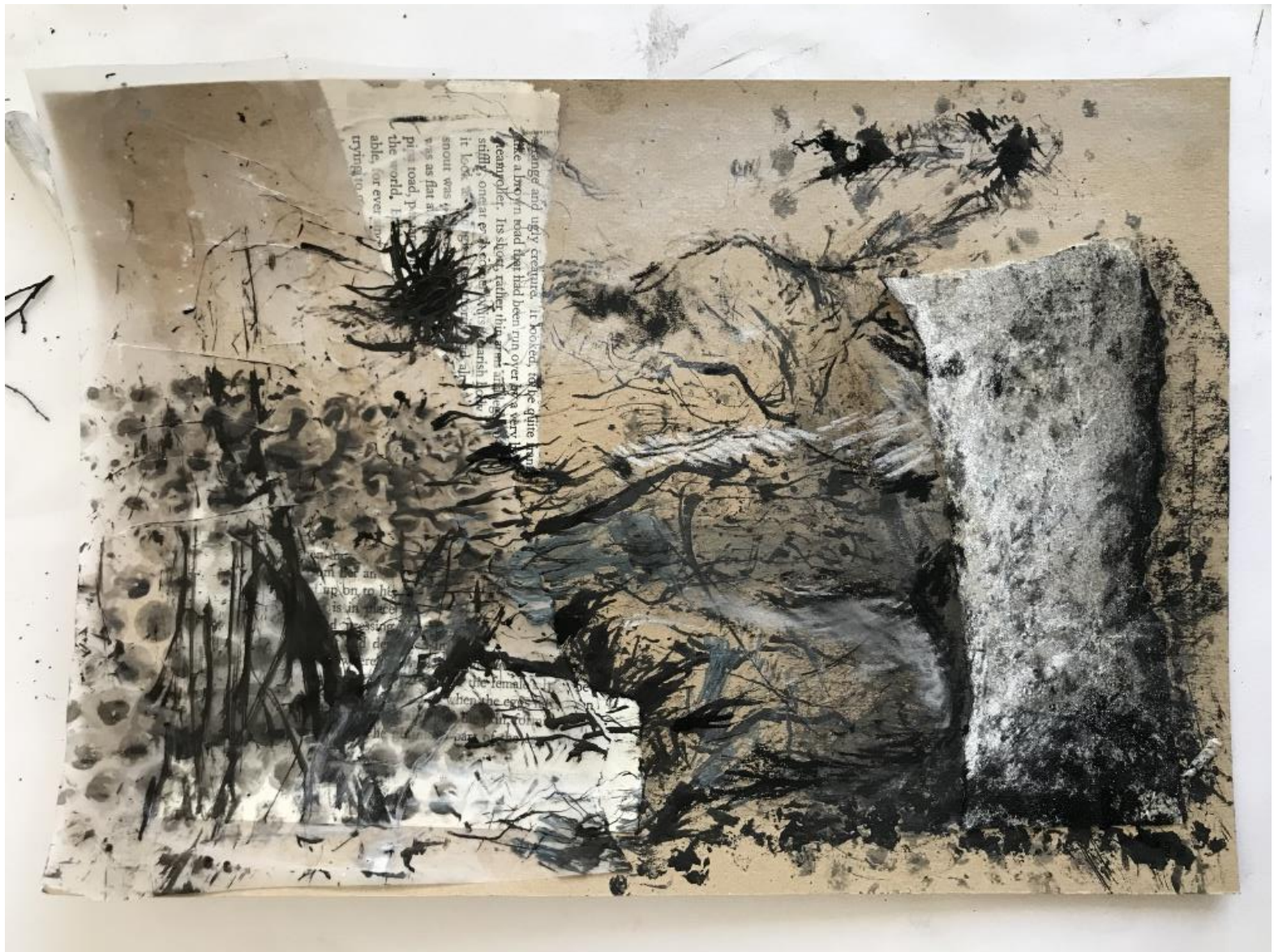
Expressive Mark-Making on Porthmeor Beach