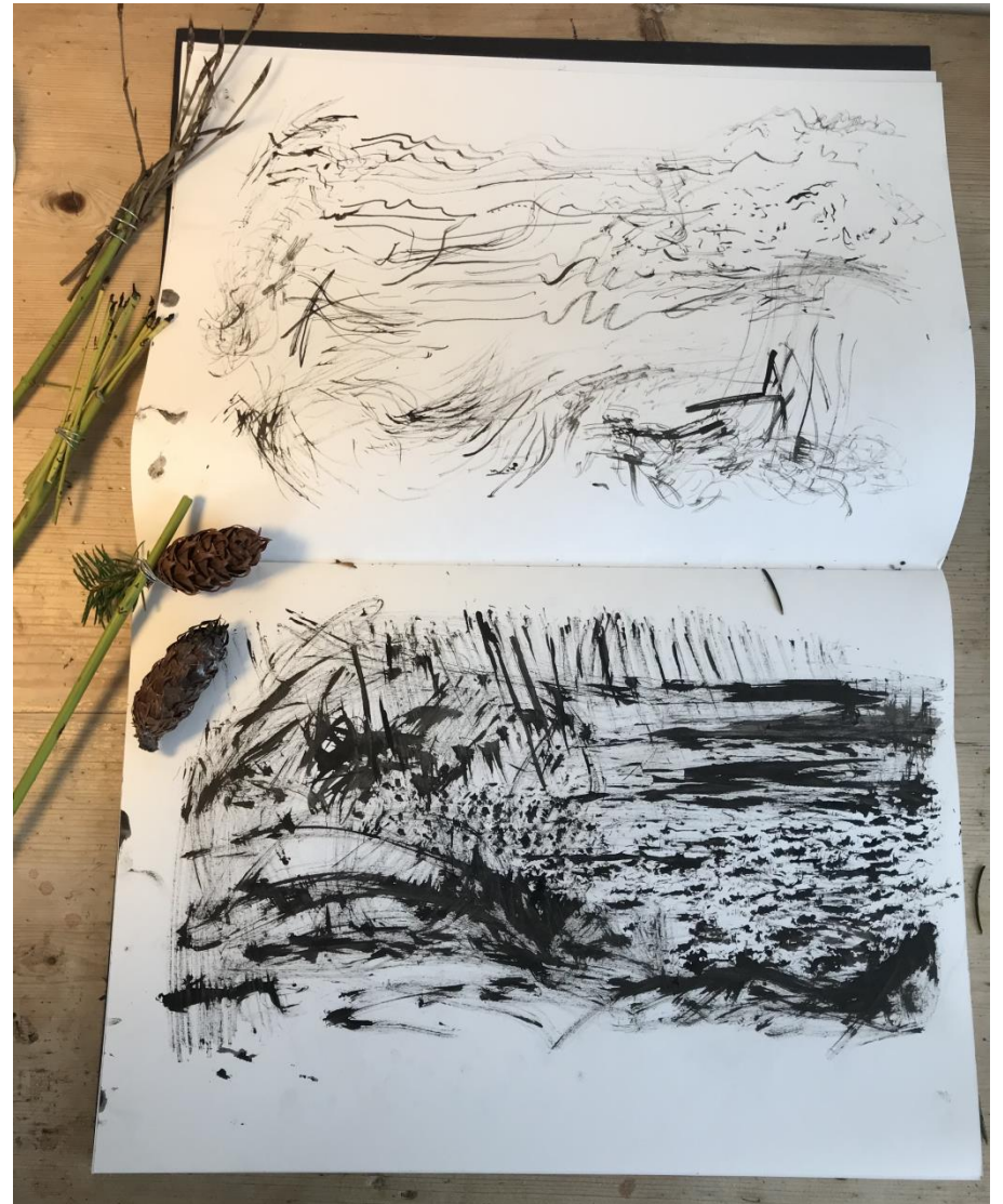
Expressive Mark-Making on Porthmeor Beach with Rowena Tarplee