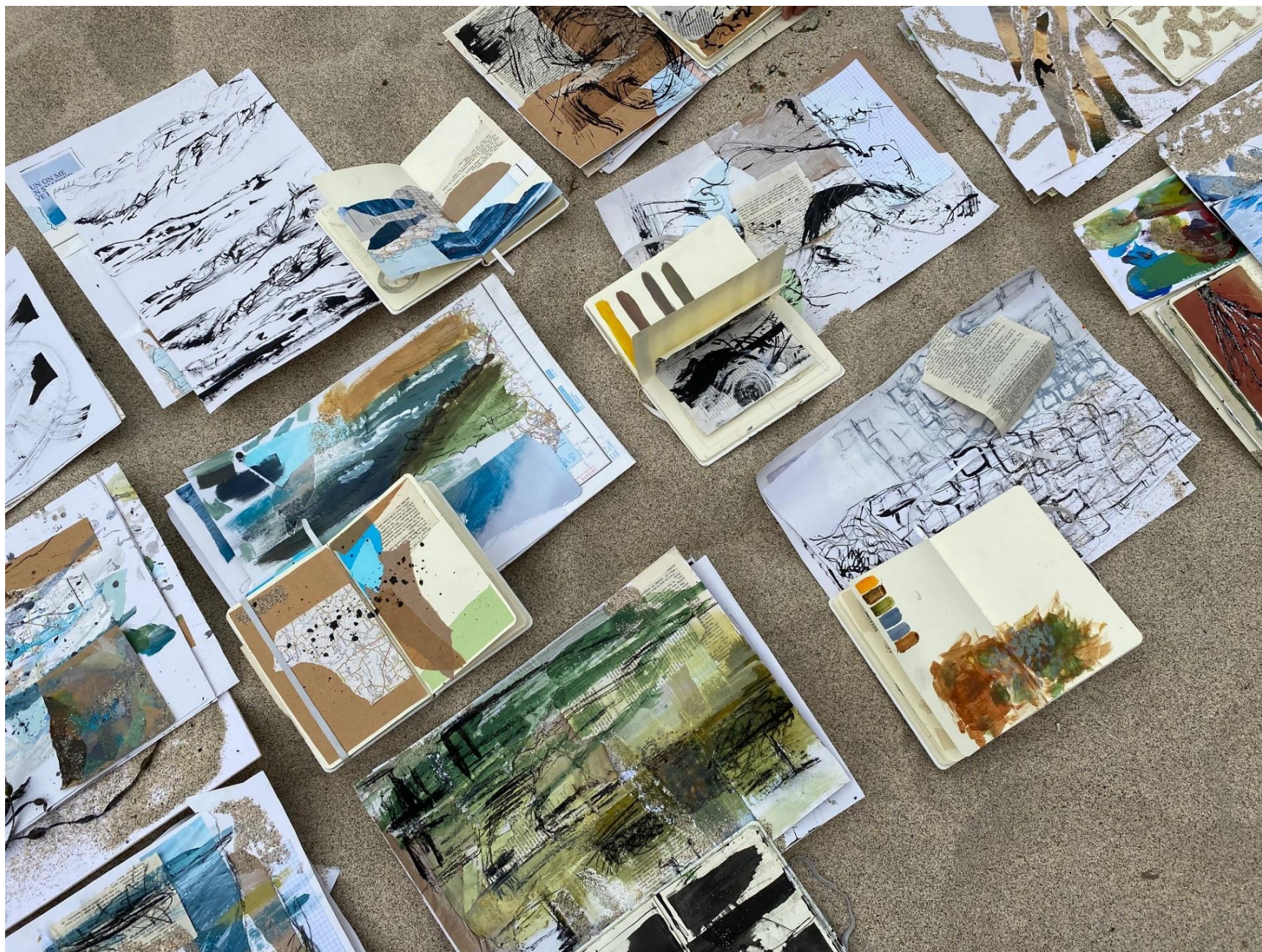
Examples of work produced on my Expressive Mark-Making Workshop with links to Lanyon