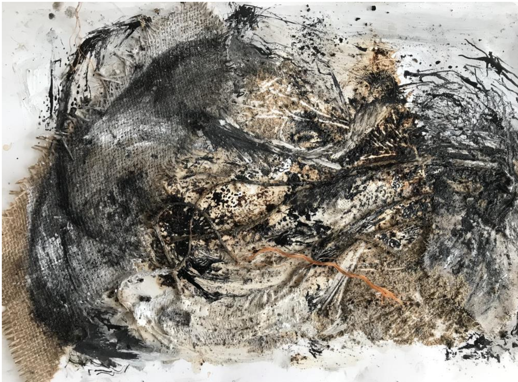
Experimental Painting in the style of Sandra Blow