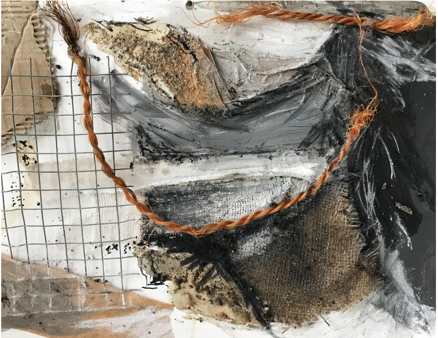
Mark-making, abstraction, collage and surface